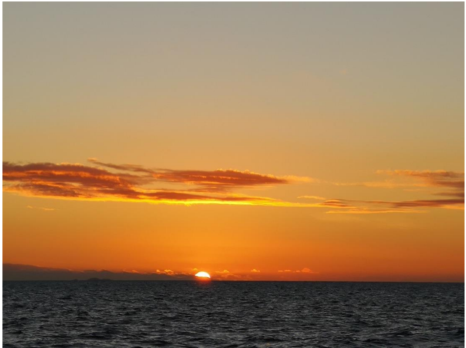
Sunset on arrival in Fiji

After more back & forth with emails and phone calls, I complete my vacillations and decide on Fiji. Before weighing anchor on 20<sup>th</sup> June, I install yet another set of navigation lights on the pulpit. (I'm getting good at the wiring by now; this time a wave cracked the lens to let the water in.) To avoid clearing in over the weekend, we reduced sail and boat speed to 4-5kts, so we arrived at sunset after 4 days sailing, on Sunday 24<sup>th</sup> June.