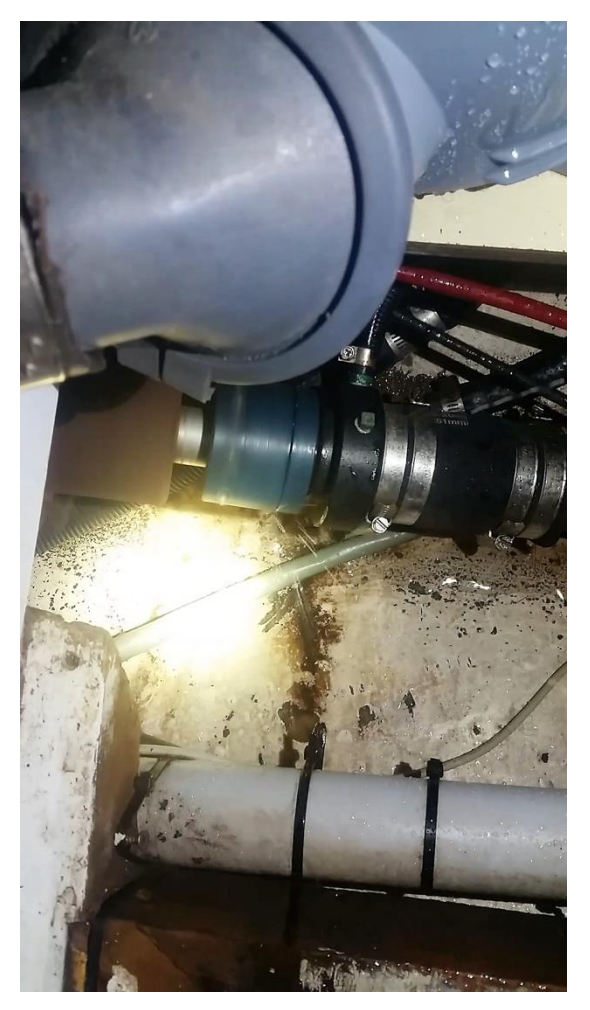
In case you were wondering what a leaking propeller shaft seal looks like

the gale force winds and 8m waves between Lord Howe Island & Sydney two years ago (Careful what you wish for) – and on reflection, probably not a great way to finish the last leg.