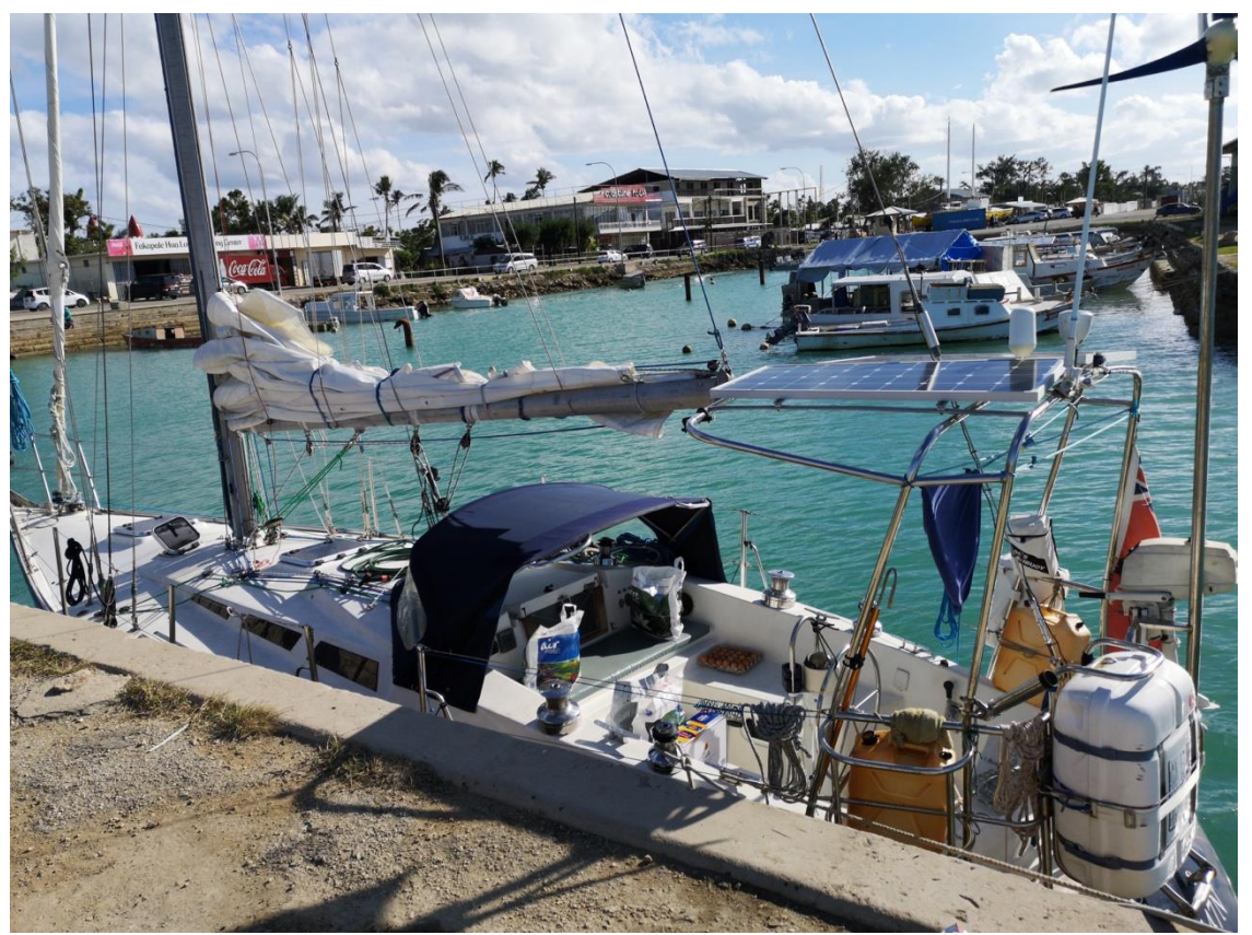
The small boat clearing wharf at Nuku alofa

Tonga a.k.a. The Friendly Islands, is spread over 700,000 square kilometres with 169 islands, 36 of which are inhabited. 70% of the of the population of circa 100,000 live on the main island of Tongatapu. Clearing in was also a friendly process with the officials coming to the boat at the small boat clearing wharf.