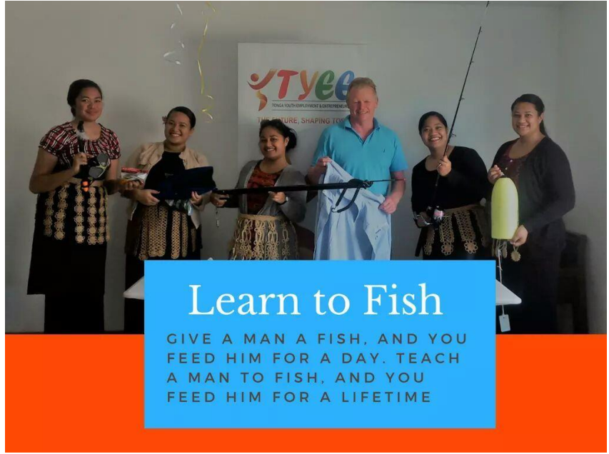
The TYEE crew about to go fishing

I also had some fishing & snorkeling gear to give away which the Tonga Youth Employment & Entrepreneurship group were happy to receive.