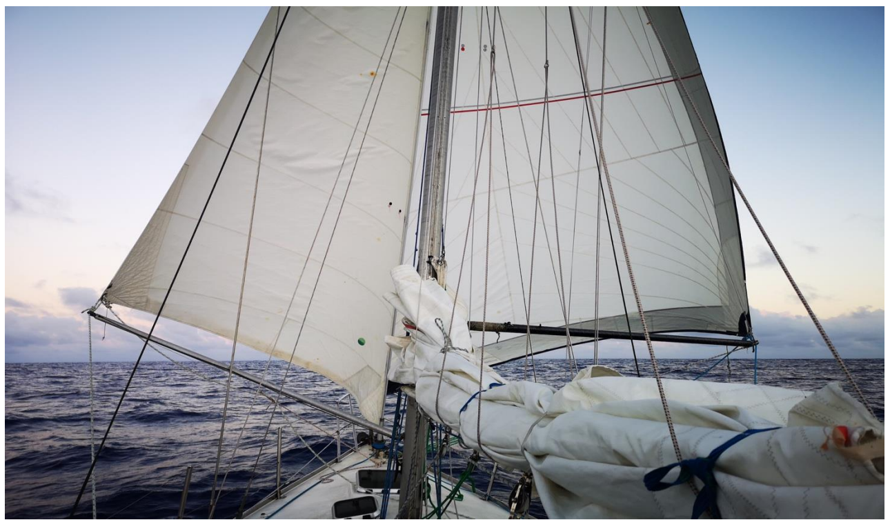
Downwind with two headsails