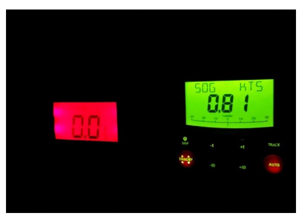
A Slow Night

While Galaxy is well south of the equator (18°S) in the trade wind belt, we are also in the midst of the South Pacific Convergence Zone and encounter long periods with winds 0-5 kts. At one point we are going backwards at 1kt in a counter current and averaged 2.8kts for the day.